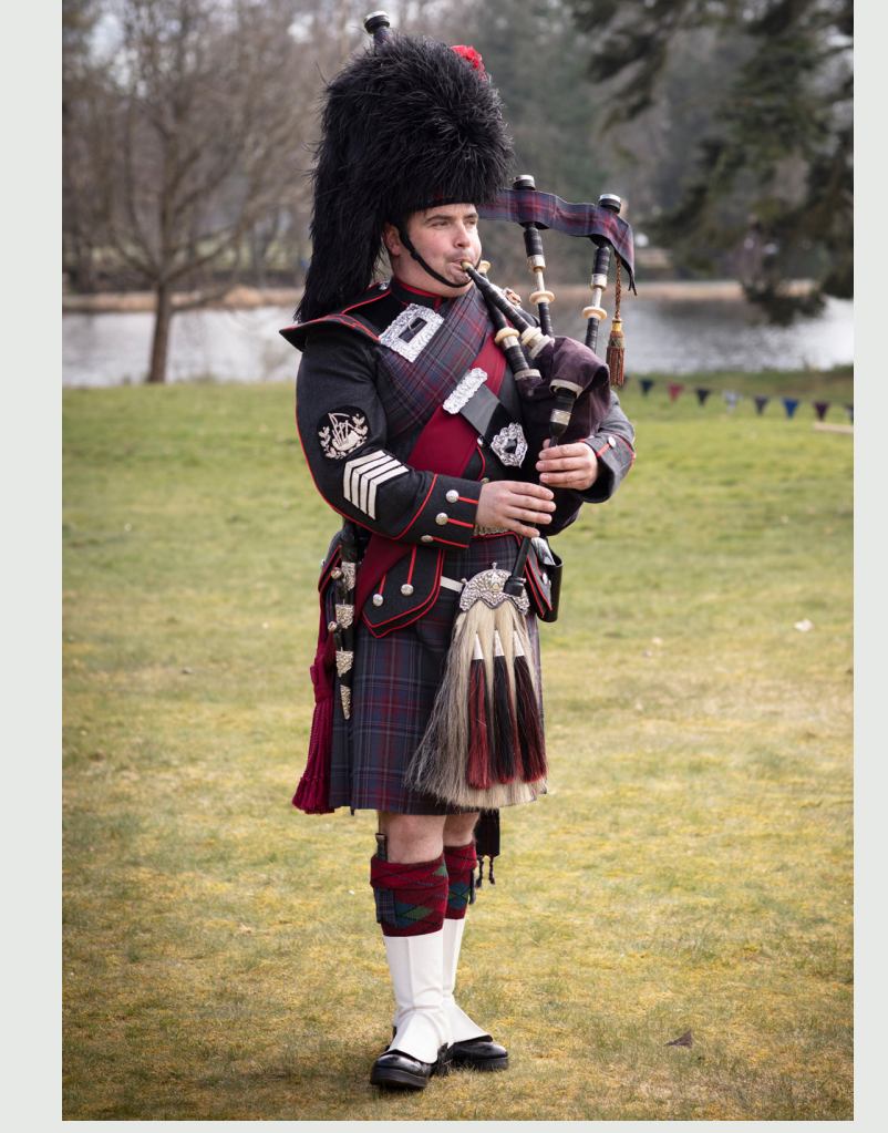
DAY 2 THE GLORIOUS PLAYGROUND