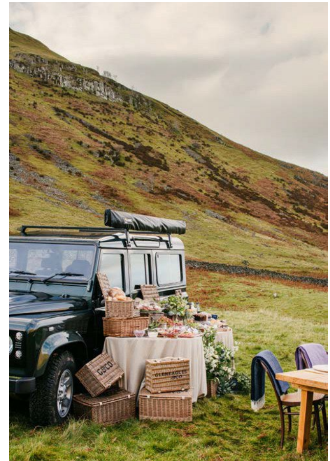
Served by one of the team in a Land Rover Defender at a local scenic location – Subject to availability and weather permitting.

Poached Scottish lobster Gleneagles & Co smoked salmon Roast sirloin of Tweed Valley beef Garden peas and mint salad King prawn salad Heritage tomato, baby basil Rustic rolls, oatcakes – butter portion Scottish cheeses, Gleneagles & Co onion marmalade Seasonal Perthshire berries, lemon curd and cream Selection of afternoon tea cakes Scones, jam and cream Highland Spring still or sparkling water Freshly brewed coffee or tea